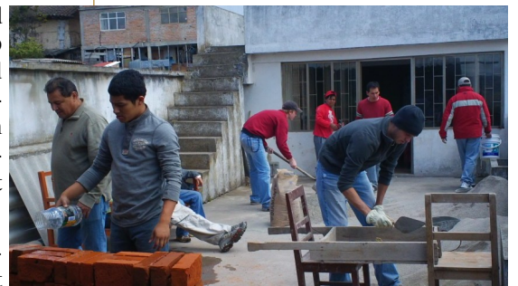
Preparing mortar, laying brick, hauling gravel in near freezing weather, 11,000 Ft above sea level in Tuquerres, Colombia.