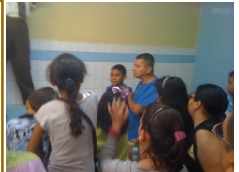
One of seven baptized in Venezuela.