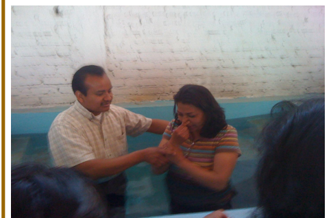
One of six baptized in Cuautitlan, a suburb of Mexico City during a campaign this month.