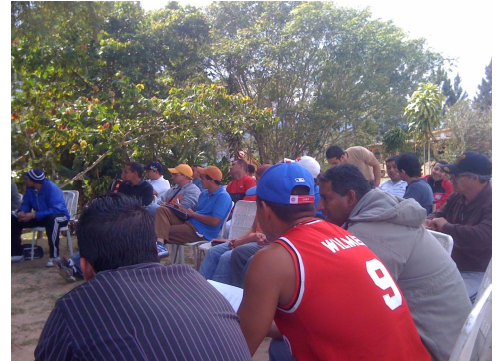
A record attendance of 68 preachers attended the retreat in Central Venezuela in March. A great example of unity!

Now may the God of patience and comfort grant you to be like-minded toward one another, according to Christ Jesus, that you may with one mind and mouth glorify the God and Father of our Lord Jesus Christ.” Rom. 15:5